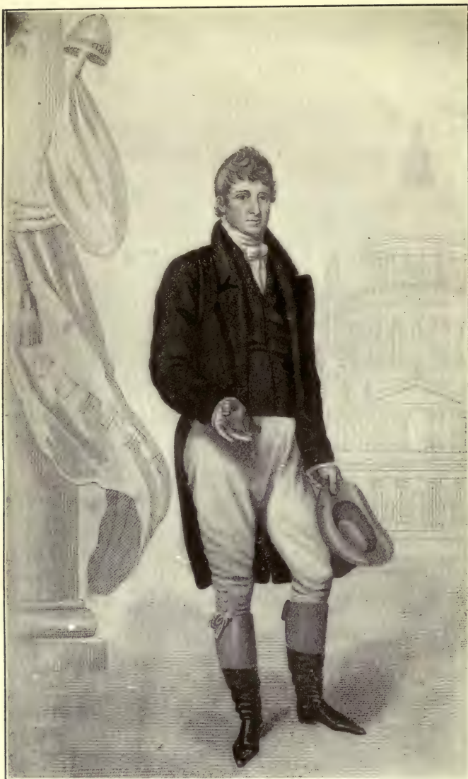
"ORATOR" HUNT, 1773-1835 CHAIRMAN OF THE PETERLOO MEETING