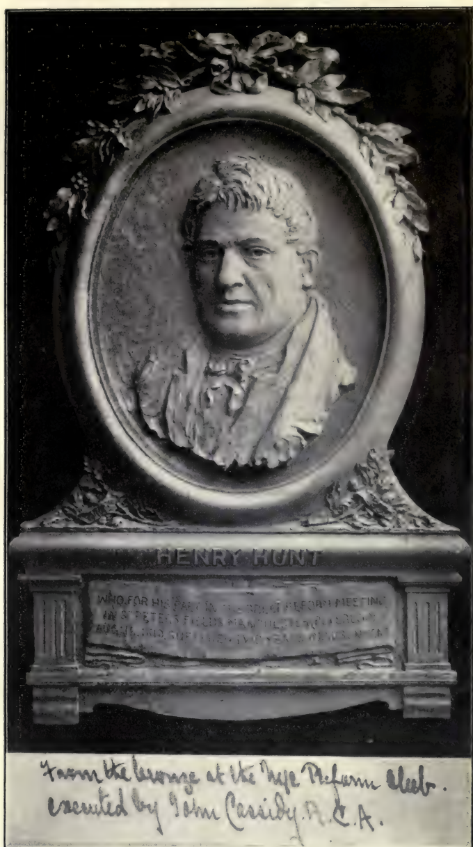
THE HUNT MEMORIAL IN THE VESTIBULE OF THE MANCHESTER REFORM CLUB