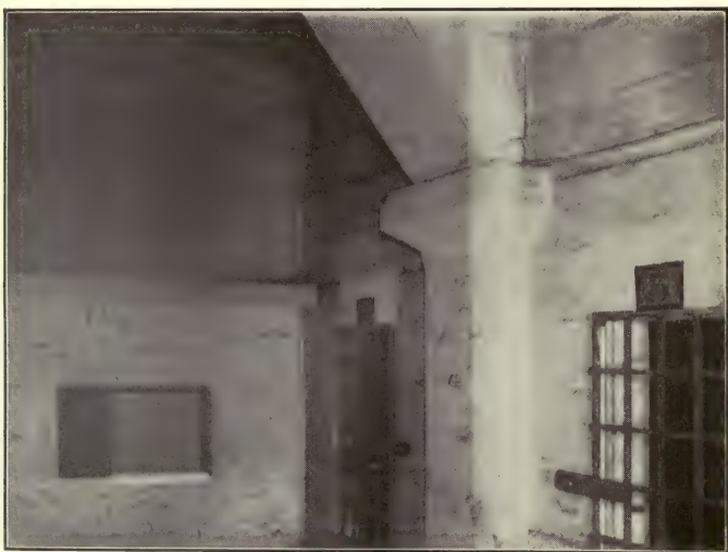
THE PRISON CELLS IN LANCASTER CASTLE WHERE HENRY HUNT AND SAMUEL BAMFORD WERE CONFINED AFTER PETERLOO