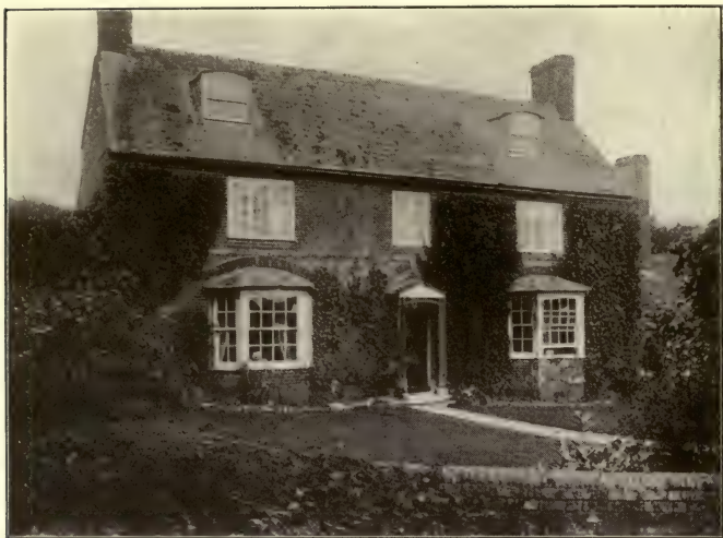
HENRY HUNT'S BIRTHPLACE ON SALISBURY PLAIN